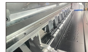
High mechanical precision printing platform