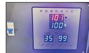
Powder shaker control unit