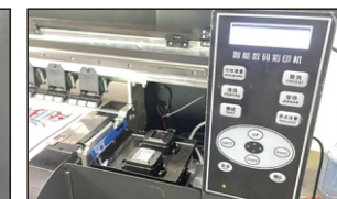
Printer control panel