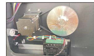
Branded stepping motor